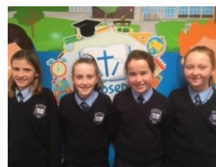
Shining Light Prefects